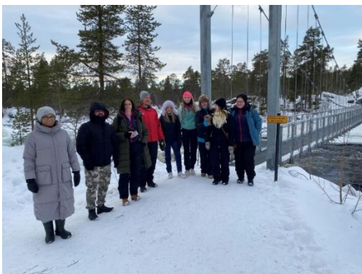
Together in front of a spectacular bridge