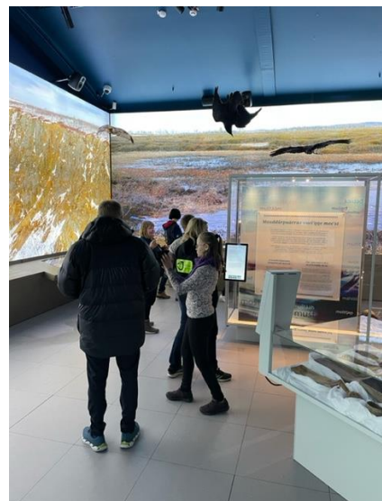
A glimpse from the Siida museum