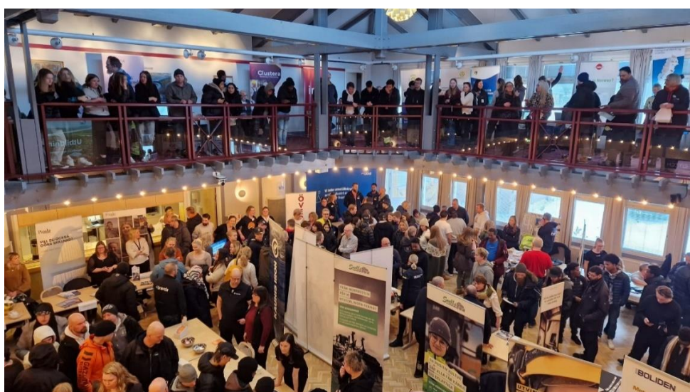
A birds eyes' view of the recruitment fair at Utbildning Nord