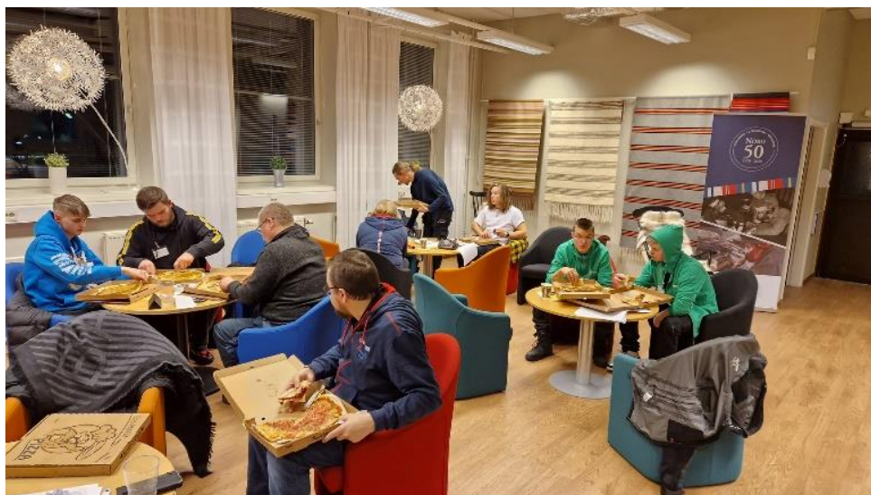
One pizza each. The participants left Sweden with a full belly

- I will participate in the competition in March. At least there is no tension yet, says Nelli.