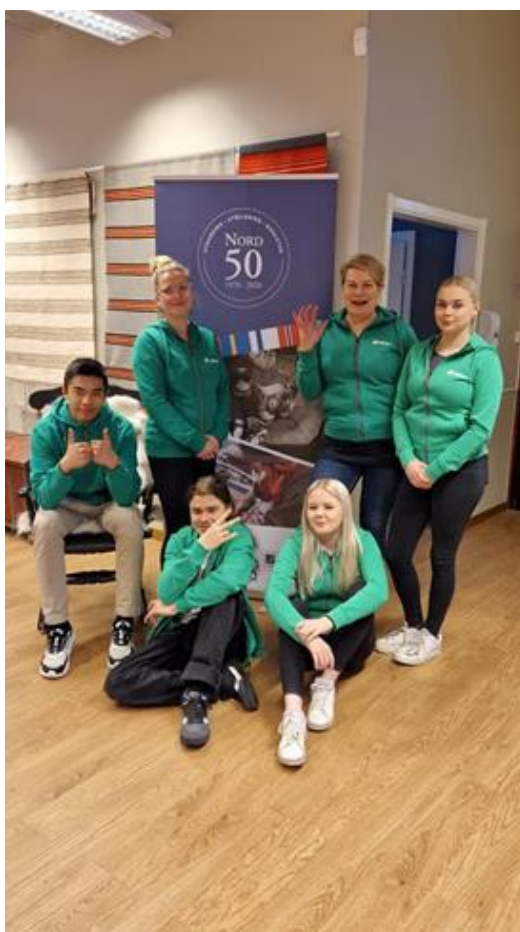
The Redu delegation in front of the logo of Utbildning Nord. Thumbs up!