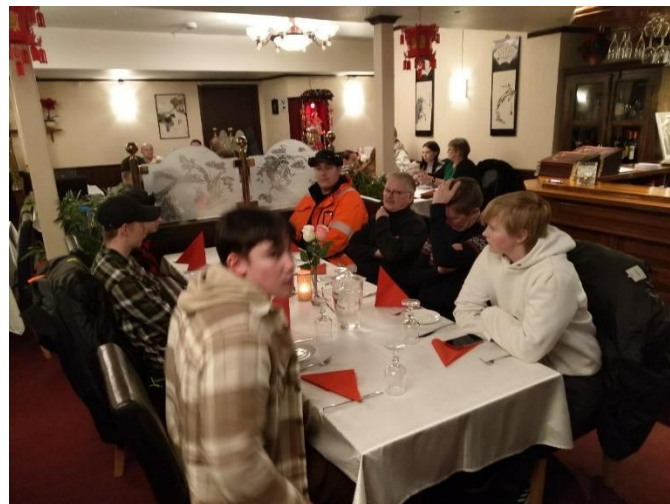
Thai food on the menu