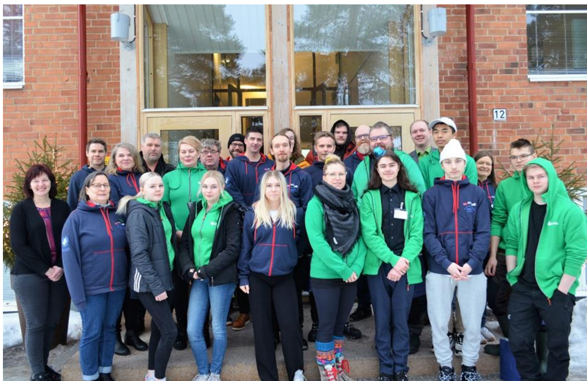
The participants from Redu, Kirkenes and Lappia together with their hosts from Utbildning Nord, Gränselvsgymnasiet and Tornedalsskolan.

The guests were accommodated at hotel Kievari but had most of their meals at college. Five enterprises were involved in the program: Camp Torne Valley Experiences, Explore the North AB, the holiday village of Luppiovaara, Cape East and Stadshotellet Haparanda. The exchange coincided with the traditional trade fair at Utbildning Nord, which gathers most of the branches and enterprises in Norrbotten