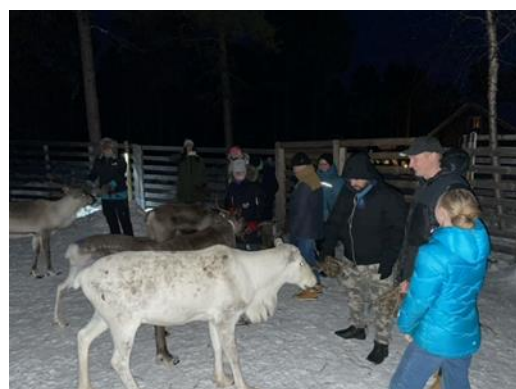
The Inari group visiting Angeli Reindeer farm