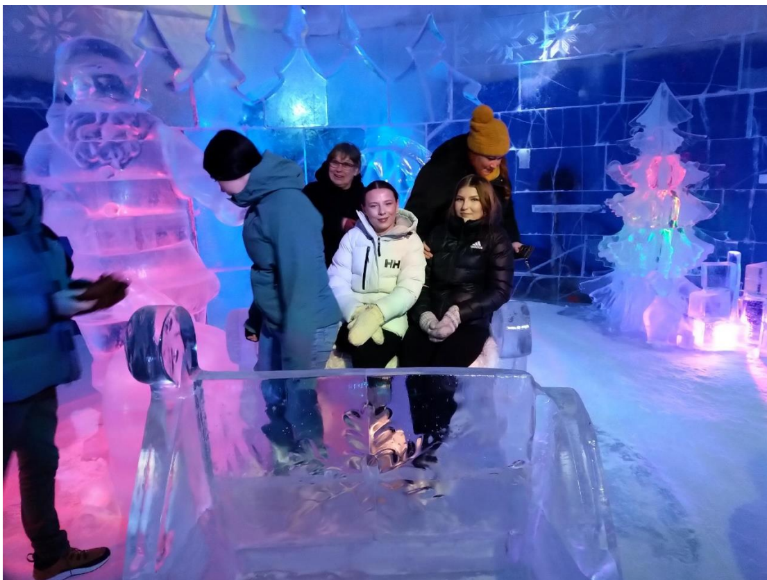
Visiting Kirkenes Snow Hotel