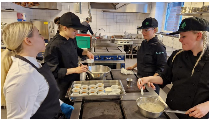
Collaboration is the main road to success

All these questions are of course subordinate to the main question, that is finding a sustainable model and financing of ArcticSkills. This is still an ongoing process.